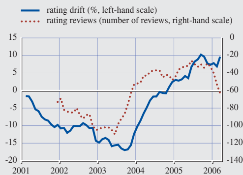
Chart B3.1 Credit rating drift and issuers placed under rating review

Sources: Moody's and ECB calculations. Note: These figures also include non-euro area western European countries. The "rating drift" is defined as the difference between the number of credit rating upgrades to credit rating downgrades over the total number of rated issuers (trailing 12-month). "Rating reviews" indicates the number of issuers put on review for upgrades and downgrades respectively (12-month moving sum). A high negative figure indicates that more firms are being put on review for downgrading than for upgrading.